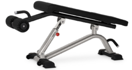
ADJUSTABLE ABDOMINAL DECLINE BENCH 9NN-B7200