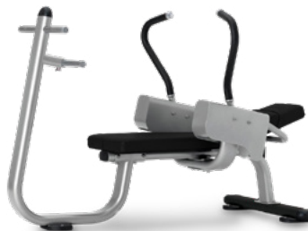
AB BENCH 9NN-B7505