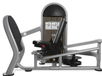
DUAL LEG PRESS/ CALF RAISE 9NL-D1013