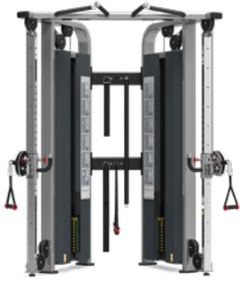
DUAL ADJUSTABLE PULLEY 9NL-D2002