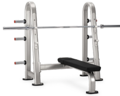
OLYMPIC FLAT BENCH 9NN-B7503