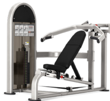
DUAL MULTI-PRESS 9NL-D2120