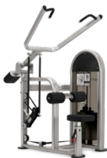
LAT PULL DOWN 9NL-S3310