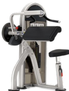
DUAL BICEPS CURL/TRICEPS EXTENSION 9NL-D5120