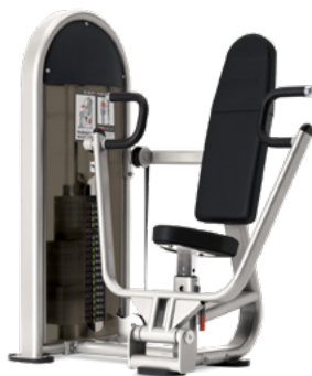
CHEST PRESS 9NL-S2100