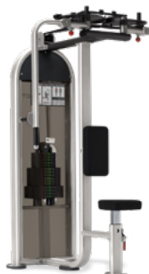
DUAL PECTORAL FLY/REAR DELTOID 9NL-D2110