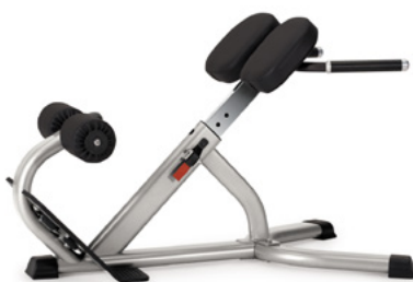
45 DEGREE BACK EXTENSION 9NN-B7502