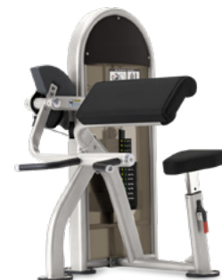
BICEPS CURL 9NL-S5100