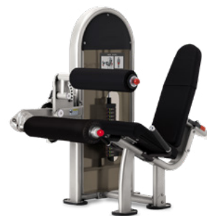
LEG CURL 9NL-S1011