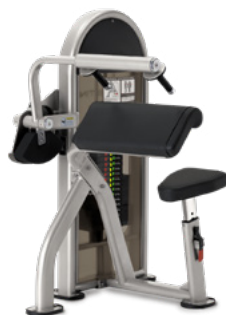
TRICEPS EXTENSION 9NL-S5110