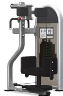
ROTARY TORSO 9NL-S6300