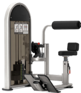
DUAL ABDOMINAL/LOWER BACK 9NL-D6330