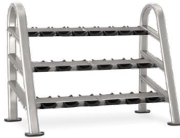
DUMBBELL RACK 10-PAIR/3 TIER 9NN-R8002