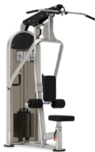
DUAL LAT PULL DOWN/VERTICAL ROW 9NL-D3340