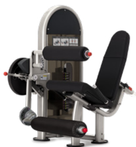
DUAL LEG EXTENSION/ LEG CURL 9NL-D1014