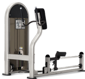
GLUTE PRESS 9NL-S1012