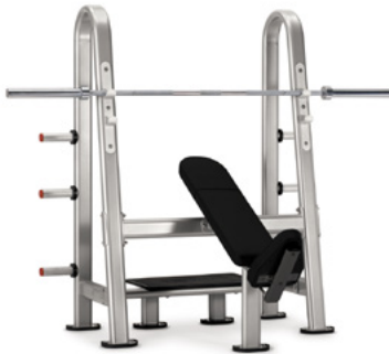
OLYMPIC INCLINE BENCH 9NN-B7201