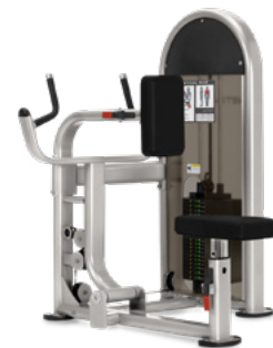
VERTICAL ROW 9NL-S3320