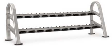
DUMBBELL RACK 10-PAIR/2 TIER 9NN-R8001