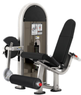
LEG EXTENSION 9NL-S1010