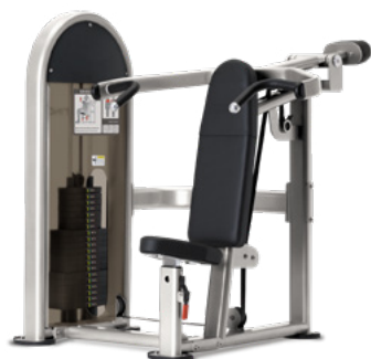
SHOULDER PRESS 9NL-S4100