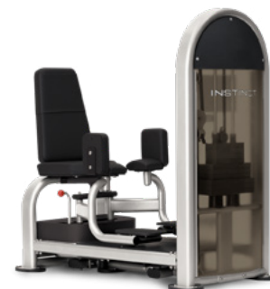
DUAL INNER/ OUTER THIGH 9NL-D1015