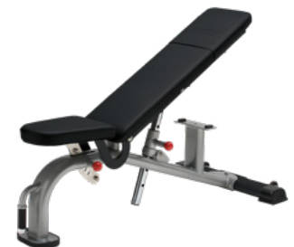
MULTI-ADJUSTABLE BENCH 9NN-B7501